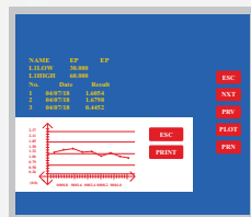
LJ/SD QC Chart